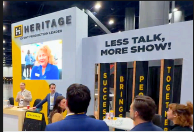
Inset LED Wall