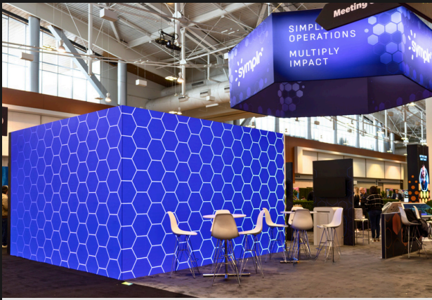
Wraparound LED Wall