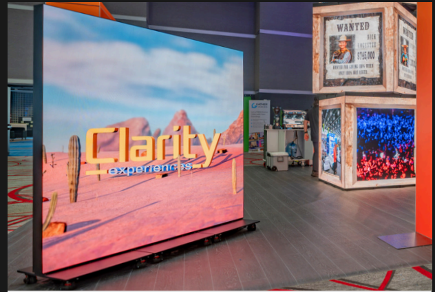
Seamless LED Posters