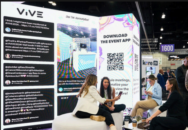
Custom LED Structure