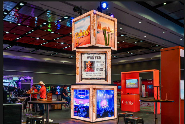
LED Cube Tower